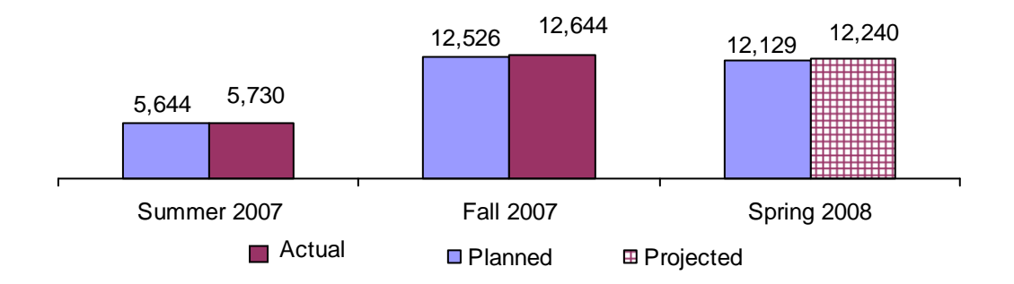
Chart 2: FY 2008 Headcount Enrollment Planned and Projected